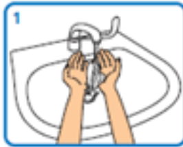
1 Wet hands with water