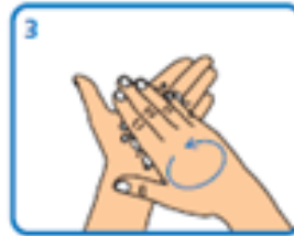
3 Rub hands palm to palm