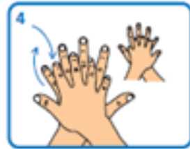
4 Rub back of each hand with palm of other hand with fingers interlaced